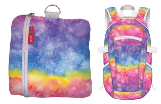
Adventure Pack closed, and open-voila!

Pick your pattern then stuff your Pack with whatever the day at camp calls for – extra clothes, a snack and of course the cell phone. Each measures 18" x 7" x 8". A zipper phone pocket and two stretch side pockets are featured with every one of the ten patterns. Take your pick among Army Camo , Dino Camo , Black Ops , Shark